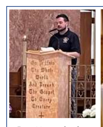
Recruiting weekend at Resurrection